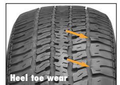
Examples of uneven treadwear